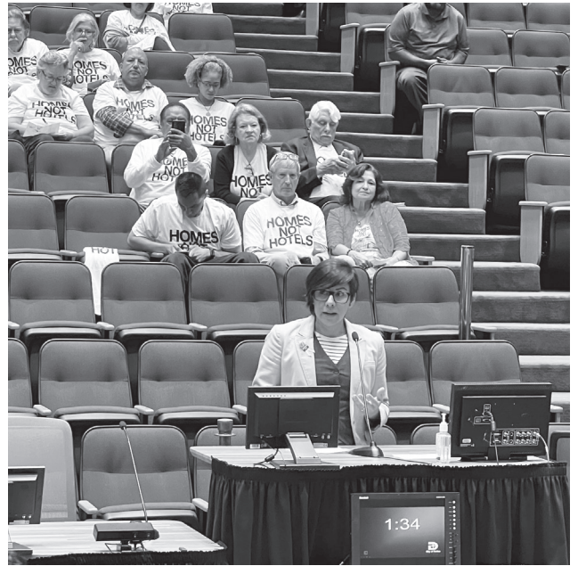
Representative Jessica González testifying before the Dallas City Council in favor of new rules banning short-term rentals in single-family neighborhoods.

After the Regular Session concluded and I returned home to Oak Cliff, I testified before the Dallas City Council in favor of new rules banning short-term rentals (STRs) in single-family neighborhoods. Everyone in Dallas deserves the right to live in peace and not get priced out of their homes because of private interests. When City of Dallas data showed that 50% of STRs were divided between 3 Council Districts, including North Oak Cliff, and with STRs being documented as a new form of gentrification, our office knew we needed to be a voice at Dallas City Hall for our Oak Cliff neighborhoods that many of us grew up in and love. Whether at your Texas Capitol or City Hall, I stand committed to protecting homeowners, renters, long-term residents, and our beloved neighborhoods.